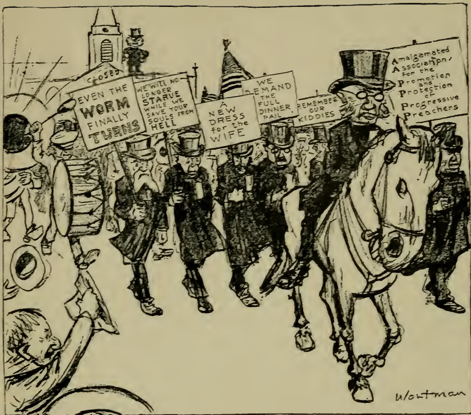
Illustration of Dr. Straton's description of the "Preachers' Strike," which appeared in the New York "Tribune" of Sept. 14, 1919.